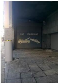
1. loading dock