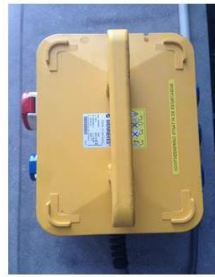
2. Connect 16A or 32A